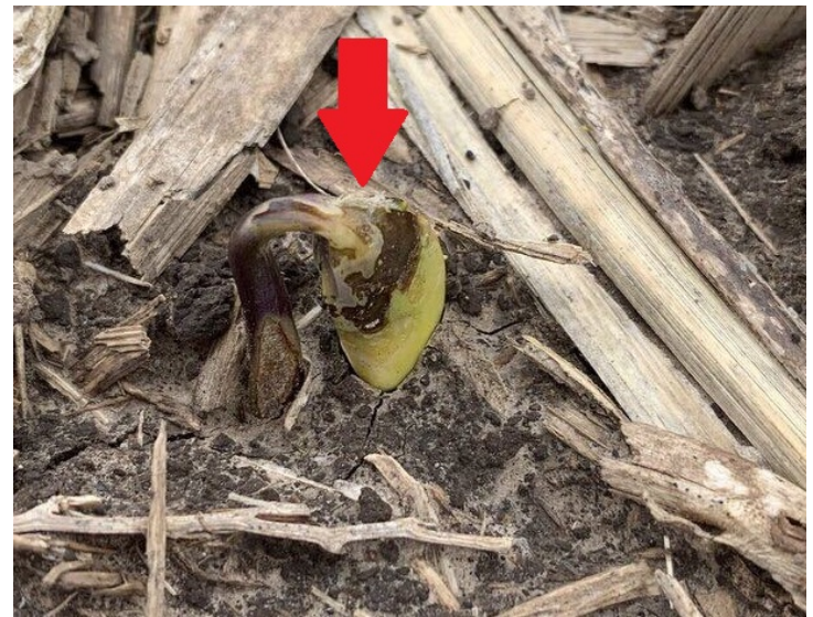
Figure 1. Soybean seedling with typical symptomology (chlorosis and necrosis on cotyledon and hypocotyl) resulting from a PRE application of sulfentrazone.

Due to widespread occurrence of glyphosate-resistant (GR) weeds, soybean producers are once again reintroducing PRE herbicides to their weed control programs. Effective PRE herbicides protect crop yield loss from early season weed competition and allow for more timely POST herbicide applications (Butts et al. 2017; Knezevic et al. 2019; Tursun et al. 2016). Although soil-applied PPO (sulfentrazone, flumioxazin) and PSII (metribuzin) inhibitor herbicides are labeled and commonly recommended as PRE herbicides for soybean, there is a concern that these herbicides may cause early-season soybean injury and affect yield. Adequate soil moisture is necessary for both PRE activation and for subsequent availability in soil solution for effective weed control. However, when soil conditions are cool and wet for extended periods of time during crop emergence, the ability of soybean to metabolize PRE herbicides is reduced, which leads to increased potential for crop injury (Moomaw and Martin 1978; Niekamp et al. 2000; Osborne et al. 1995). In addition, precipitation during the “soil cracking” stage of emergence can result in splashing of higher concentrations of PPO-inhibitor herbicides onto soybean hypocotyl, cotyledons, or growing points, which can lead to tissue necrosis (Fig. 1; Hartzler 2004; Wise et al. 2015).